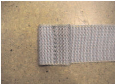
4. Unpick Leg Strap Turned End.